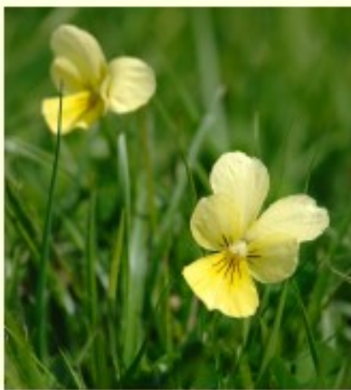
Mountain pansy ( Viola lutea )

If you find any of these plants in the Stepping Stones area, your records would be very helpful. A 10-figure OS grid reference (there are free apps for your phone if you don't have a gps), a location description, a photo, and an estimate of the quantity (eg number of flowers or size of patch). If you want, add any comments on the surrounding habitat, eg habitat type, other plants in the area, etc).