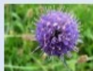
Devil's bit scabious ( Succisa pratensis )

A tall herb found in wetlands and damp grasslands. It has blue-ish purple, flattened, rounded flower heads in which all the florets are the same size. Its leaves are undivided, only lightly hairy, long and elliptical. Upper leaves may be sparsely toothed. Flowers June to October.